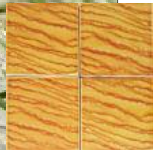
6x6 Sea Solar