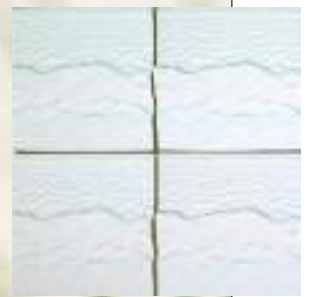
6x6 Earth Cirrus