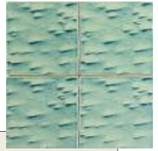
6x6 Wind Serenity